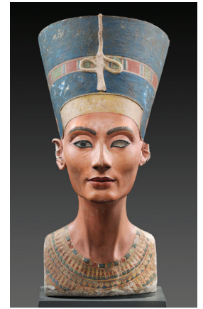
Nefertiti Bust, Egypt