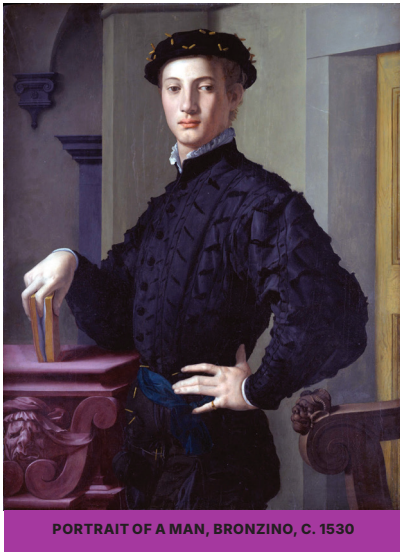
PORTRAIT OF A MAN, BRONZINO, C. 1530

The first is a 2-½-week late-Spring program that explores the artistic and architectural wonders of a European country. We travel across the country by bus and train to explore the archaeology, art, and architecture, while immersing ourselves in the culture and history of the region.