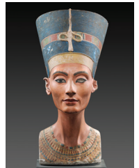
NEFERTITI BUST, THUTMOSE, 1345 BCE