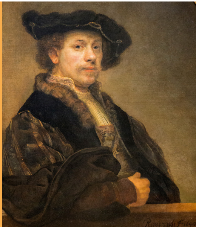
REMBRANDT HARMENSZOOM VAN RIJN, (1606-1669), SELF PORTRAIT AT 34

Examine the works of Rembrandt, Rubens, Van Dyck, Vermeer, Hals, and other 17th century Dutch painters through visual analysis and a close reading of primary and secondary source material.