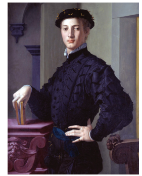
Bronzino, Portrait of a Man