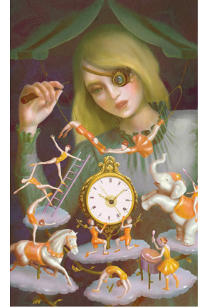
Student work by Iris Lin

Through rigorous studio courses, we teach the fundamental principles of visual storytelling and what you need to create a competitive, industry-ready portfolio.