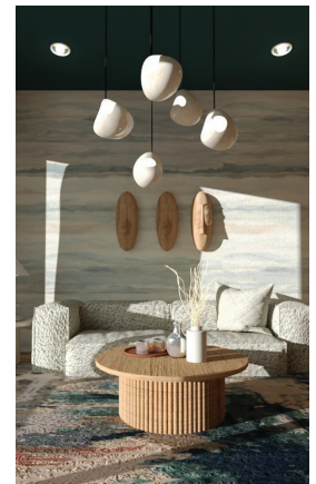
Student work by Vi Do