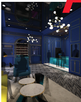
Top: Student work by Phuong Mai Bottom: Student work by Tao Ling