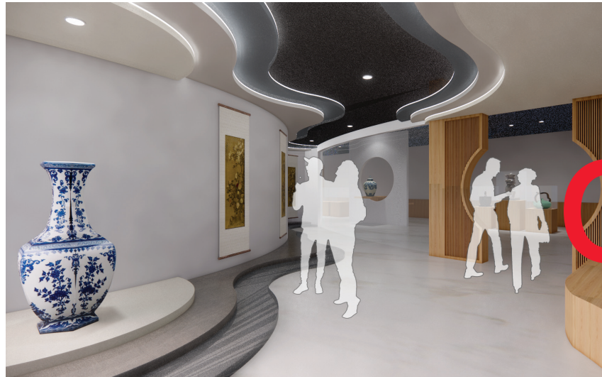
Student work by Jasmine Qian

You will study design basics and learn to solve composition problems in 2D and 3D spaces. You will also create a variety of solutions for a given challenge and present concepts to scale using sketches and models. You will learn to use the elements of design to communicate abstract conceptual ideas.