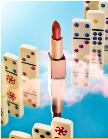
STUDENT WORK BY AYLEE RHODES