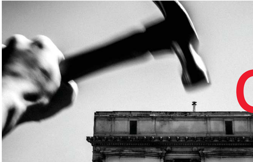
Student work by Ziyang Wang