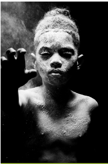
STUDENT WORK BY CRAIG WARNER