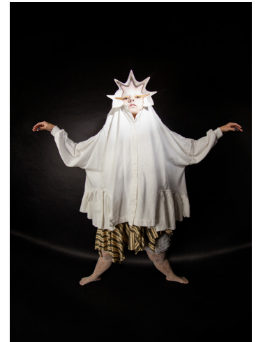
STUDENT WORK BY ALEXANDRA PESKOVA

As a student in our program, you will receive an outstanding photography education through our contemporary approach to curriculum design, small class sizes, and individualized guidance and critique. In addition, we provide collaborative opportunities with other departments to gain real-world experience working in diverse teams. Students can participate in internships in their advanced studies.