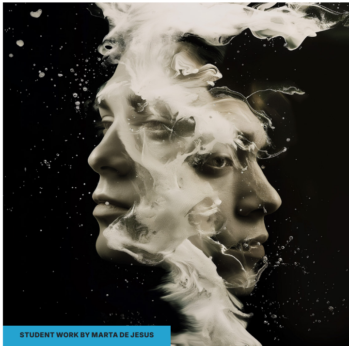
STUDENT WORK BY MARTA DE JESUS