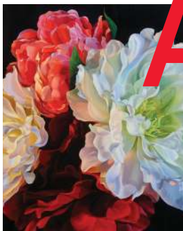
Top: Student work by Najin Bae Bottom: Student work by Mo Zhan